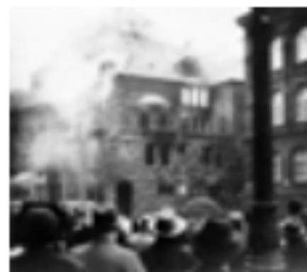
Anti- Semitism: Burning Jewish buildings in Germany